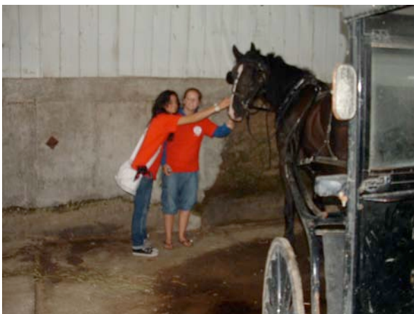
Tour the area