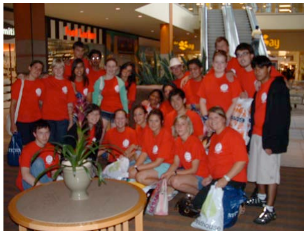
Spending the Bucks!!