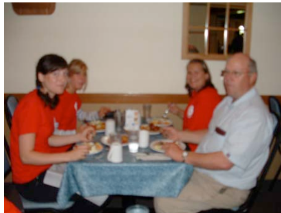
Lunch at the Crossroads