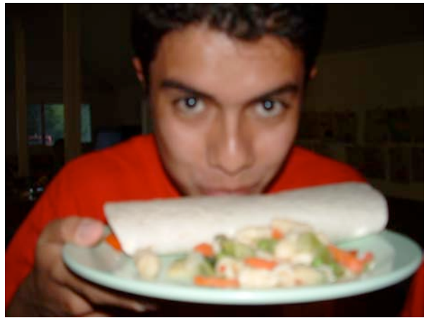
Karaoke Night (Saturday Night)