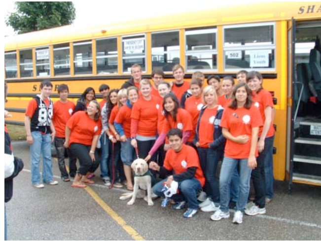
We Met Lion who is a Labrador Pup that has just begun his training.