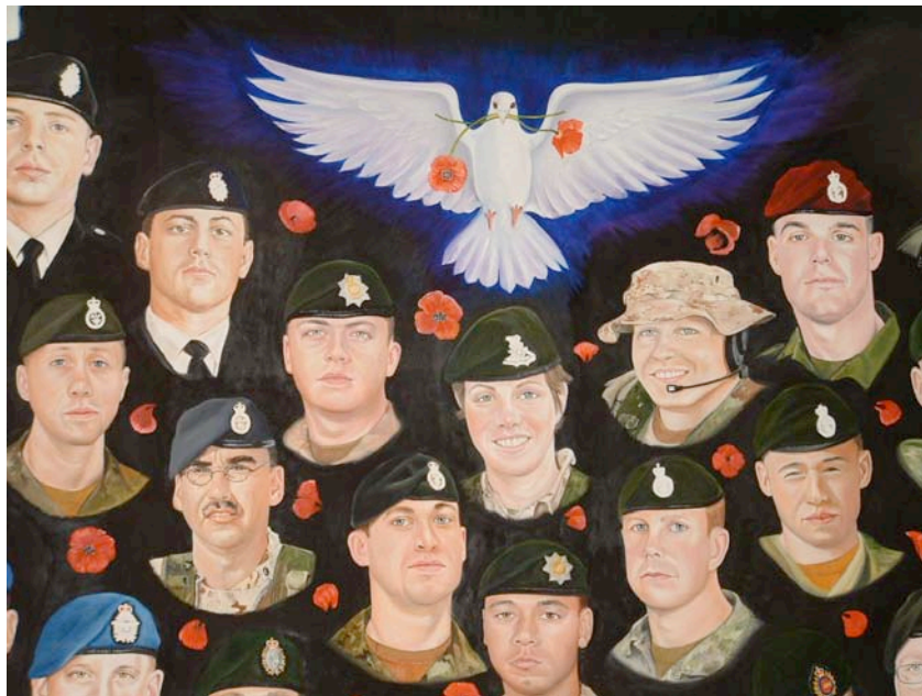
Each Soldier Killed in Action is being added To a beautifully display.

Then on to Lyle Hallman for swimming and dinner with the Kitchener Oktoberfest Lions Club.