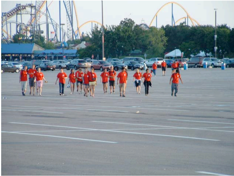
Long last walk to the bus. . . . .