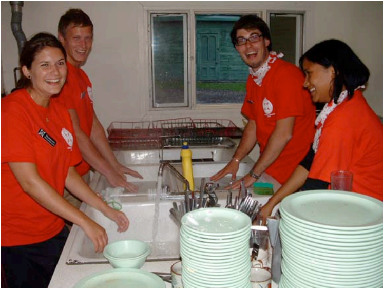
Who knew doing dishes could be so much fun. . .