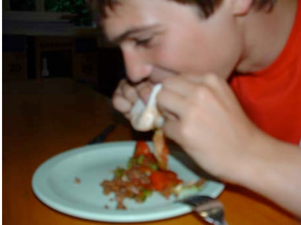
Dinner provided by Ingersoll Lions Club.