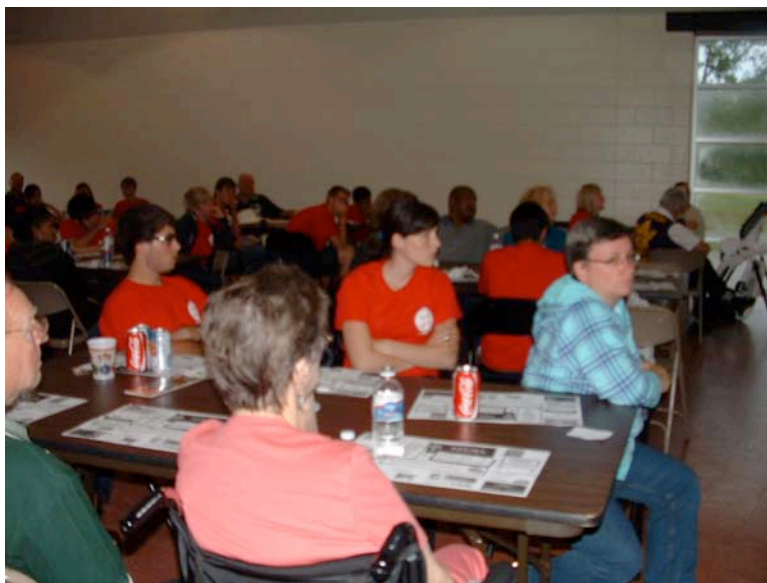
Friday, July 24 th , 2009