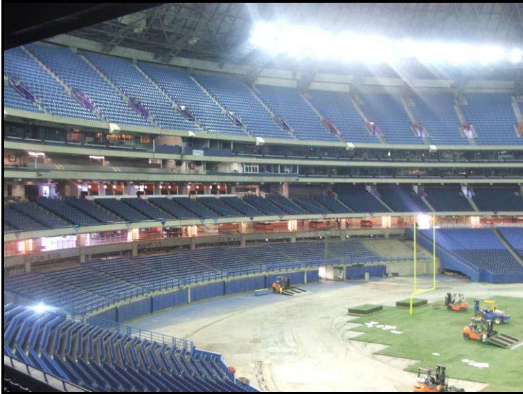
Changing the set up from Baseball to football.

Day four: A tour of the Rogers Centre formerly known as the Sky dome then a trip to the top of the CN Tower.