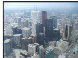
From the first domed baseball diamond to the Tallest free standing structure in the world.